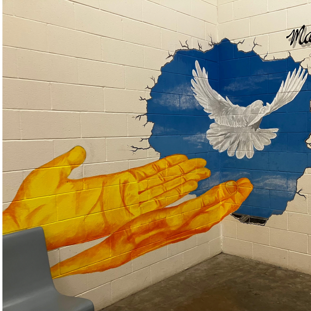
Hand-painted mural located at MCJDF