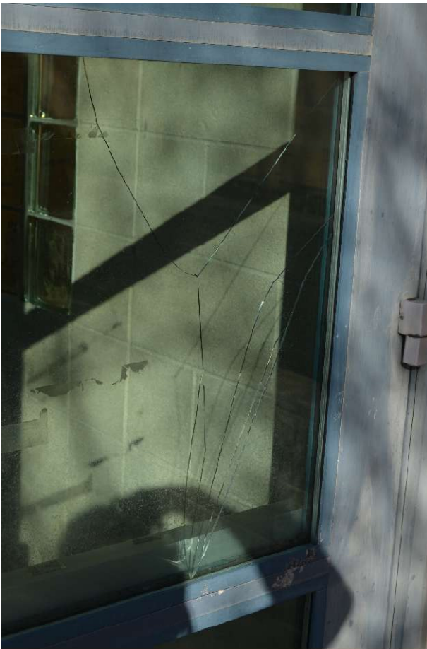
Broken window at main entrance.