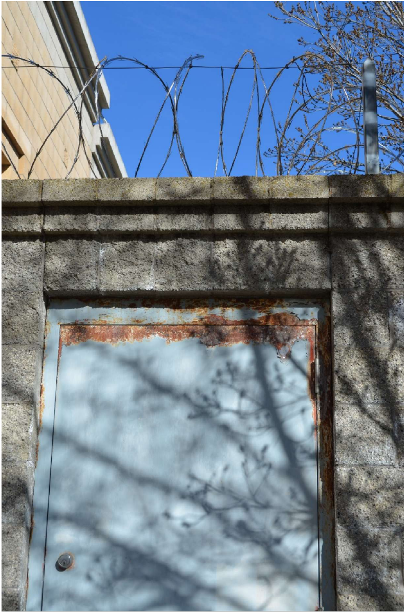
Utility door on Oregon St.