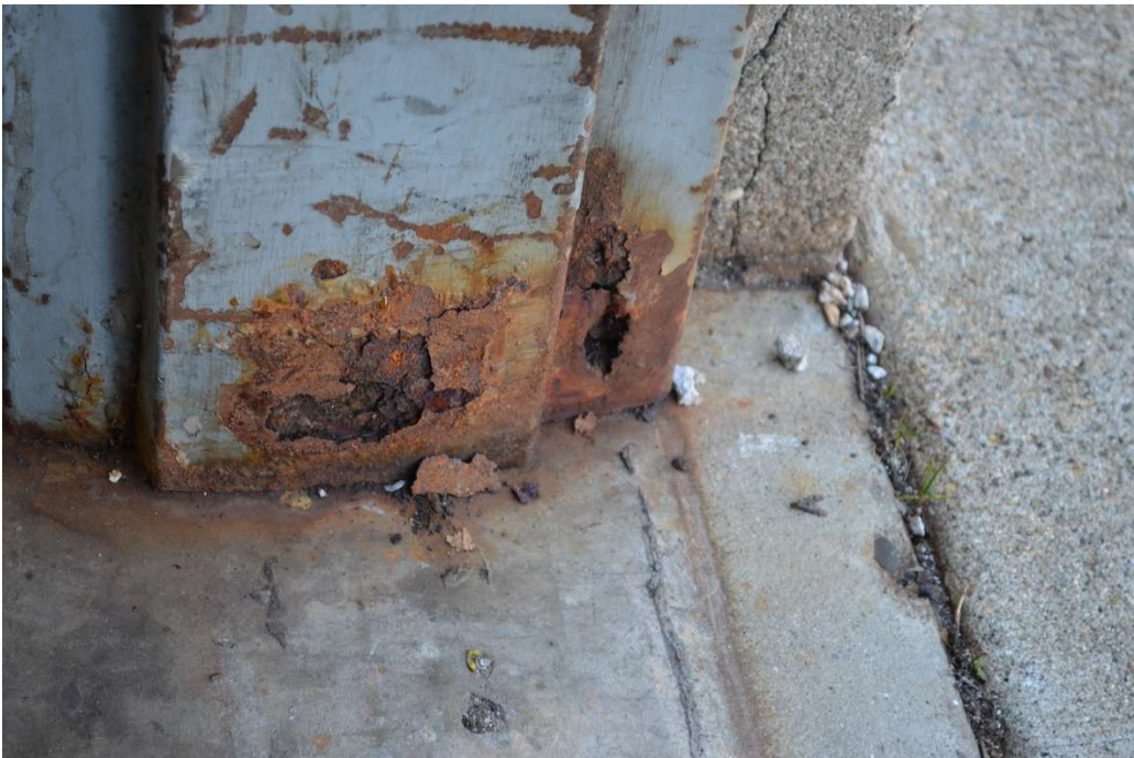
Doorway to loading area.