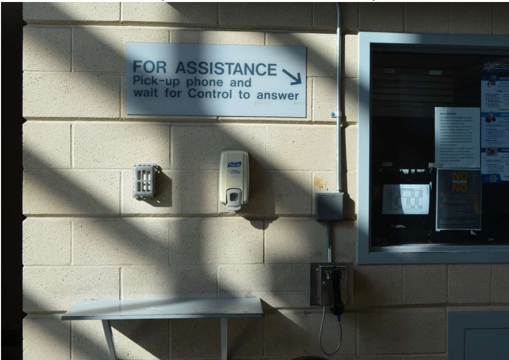
Phone broken for years.