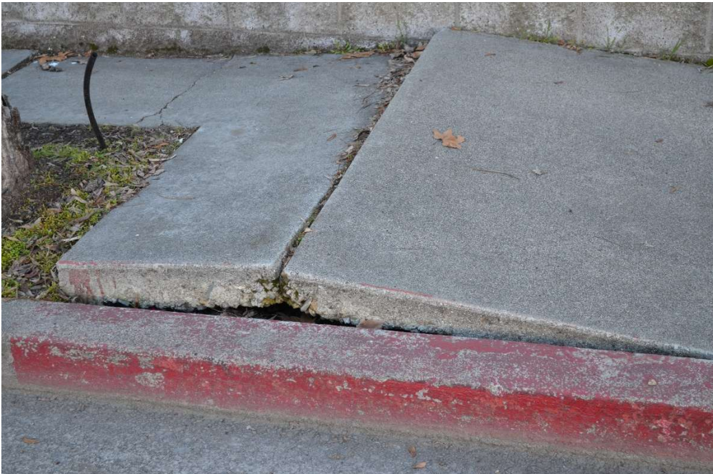
Broken sidewalk on Oregon St.