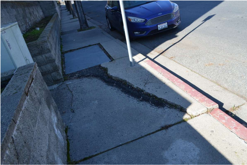
Broken sidewalk on Lane St.