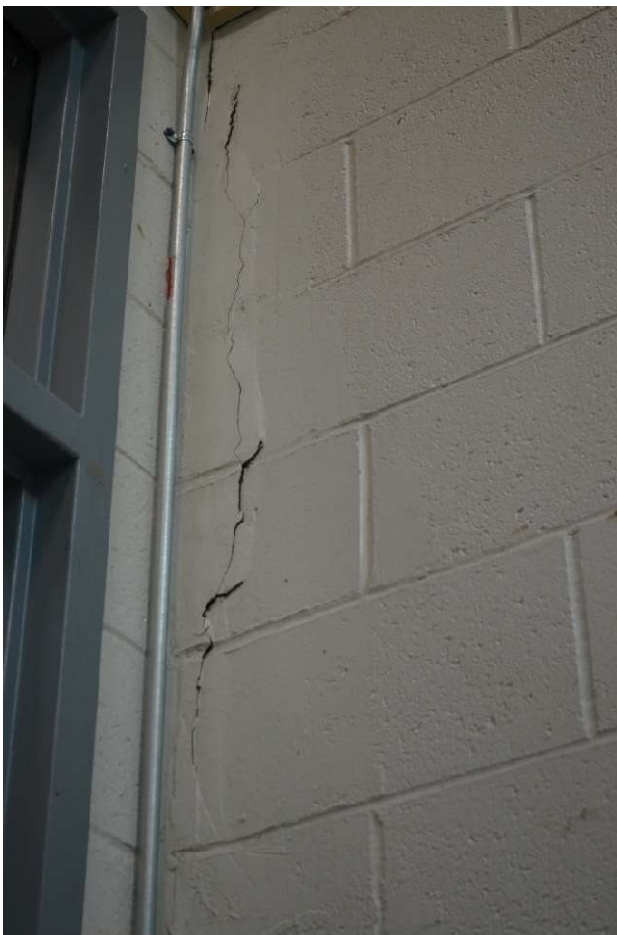
Another crack in the wall